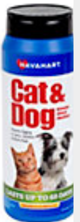
Havahart® Cat & Dog Animal Repellent - 1