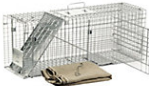
Havahart® Feral Cat Trap Rescue Kit