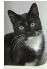
Cassidy---The "rumpy" Manx!

They share the clinic with Hopalong Cassidy, a black and white Manx mix who got her name because she kind of hops when she walks.